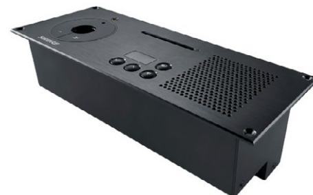
MXC620-F Conference unit